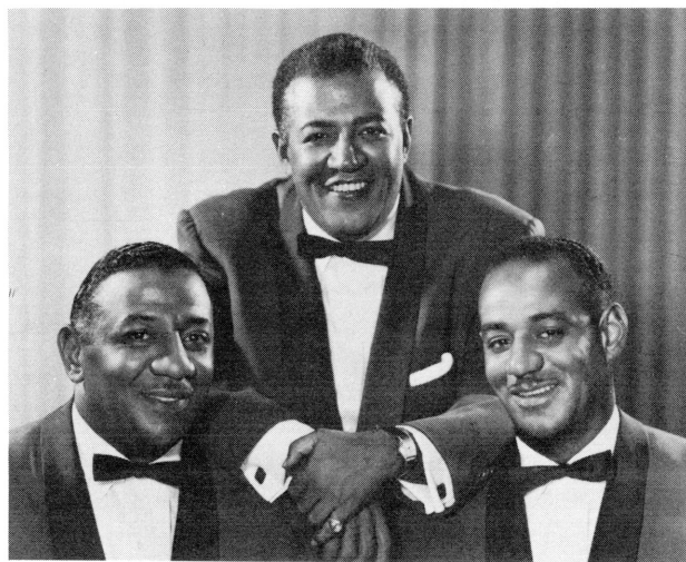
The Mills Brothers of motion picture, television and radio fame will entertain at the President's Banquet Wednesday, Nov. 10, in the Dunes Hotel in Las Vegas during the 106th ADA annual session.

In its report on Fact, the Council stated: "The Council on Dental Therapeutics has carefully reviewed the laboratory and clinical data submitted by Bristol-Myers Company in support of the effectiveness of its stannous fluoride dentifrice, Fact, for home use in the partial prevention of dental caries and has classified the product in Group B." The report continued: "The manufacturer has supplied data from a clinical study of two-year duration which was conducted on a group of school children ranging in age from 10 to 19 years, the majority falling within the age range of 11 to 17. The study was of a multiple type involving several well-balanced groups each of which was assigned a different dentifrice. "Included among these were groups assigned a non-fluoride type dentifrice, a stannous fluoride dentifrice that was previously demonstrated by clinical studies to be effective and the test dentifrice. Both the one-year and two-year data indicate a significant reduction in the incidence of dental caries when compared with the non-fluoride dentifrice,