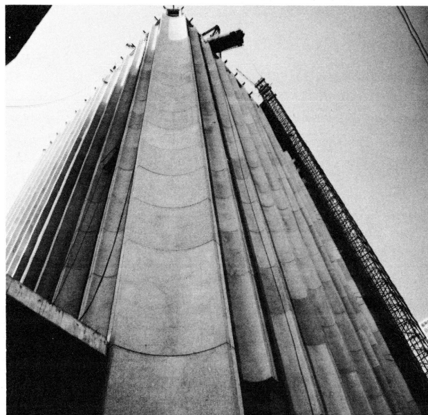
Latest progress in construction of the new ADA headquarters building was marked by the installation of two giant boilers. Picture shows one of the 37-ton boilers being swung into place on the 23rd floor which will house utility equipment. Installation of the precast concrete columns is almost complete.

The ADA has awarded a $10,000 grant to Asociacion Latino Americana de Facultades de Odontologia (ALAFOD) to advance dental education in Latin America. The grant was made to the Pan American Health Organization and will be administered by that agency to further the objectives of ALAFOD. This is the Association's first grant in support of dental schools and dental education in Latin America.