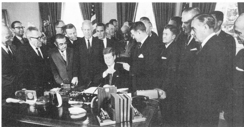
SEPTEMBER - President John F. Kennedy signs H.R. 12 surrounded by key Congressional leaders of both houses.