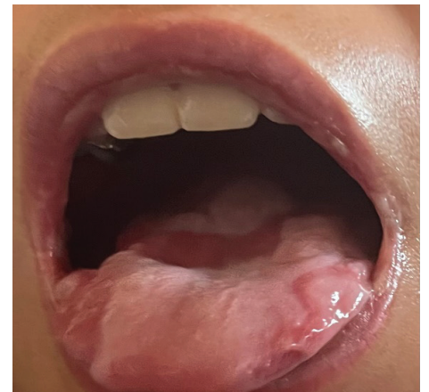
Figure #3 (RIME – Tongue)

'RIME' is a relatively new term that was initially designated strictly to the category of MIRM ( Mycoplasma -induced rash and mucositis), given that all then-recognized cases were respiratory, typically associated with M pneumoniae (4). In 2018, however, (Continued on page 12)