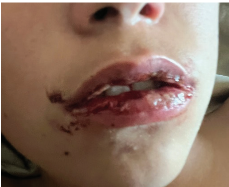
Figure #1 (RIME – Lips)

Dental professionals should become familiarized with Reactive Infectious Mucocutaneous Eruption, or (RIME), which presents with erosive mucositis typically affecting two or more mucous membranes, frequently in the oral cavity, and oftentimes is accompanied by skin lesions