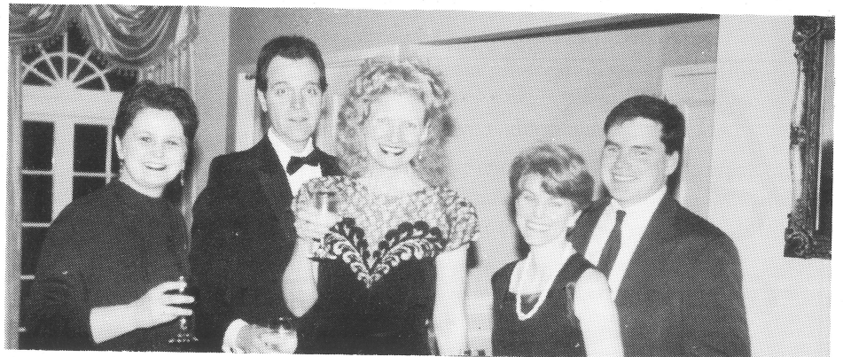
Getting together with friends at pre-dinner reception