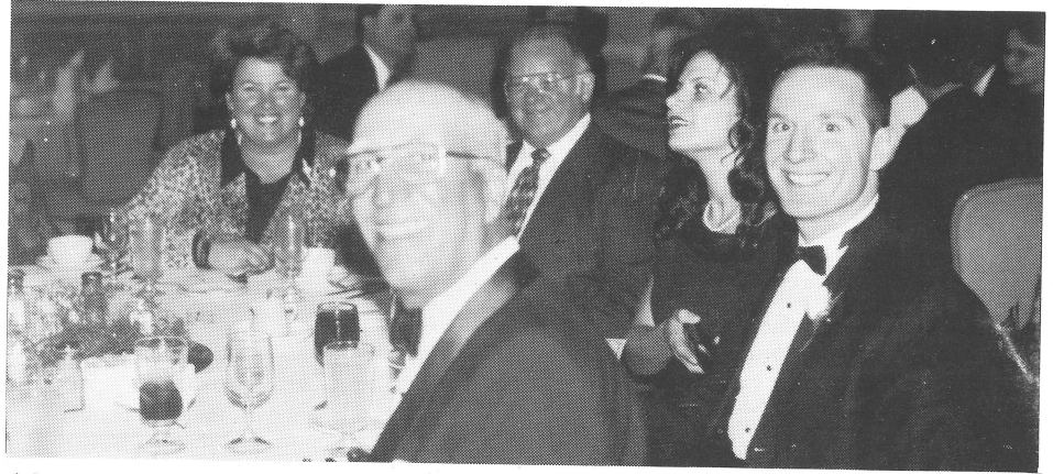
A happy table. Approximately 120 members and guests attended.