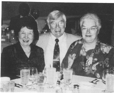
Trio pauses for photographer. The event was at the Metairie Country Club.