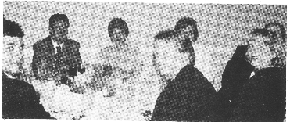
Conference Committee members were out in force.