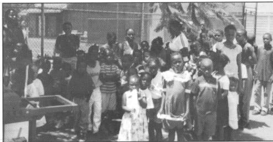
A group of young patients at Rotary dental clinic in Ocho Rios.