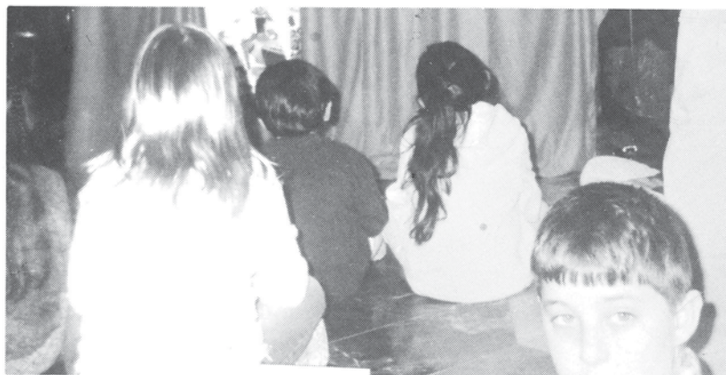
The puppet show on dental care was a big hit.