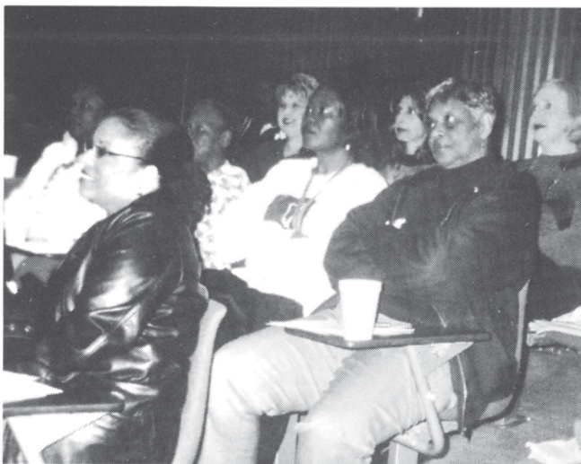
Teachers, school nurses at seminar, a feature of Children's Dental Health Month.