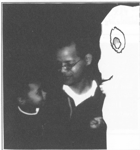
Meeting Happy Tooth.