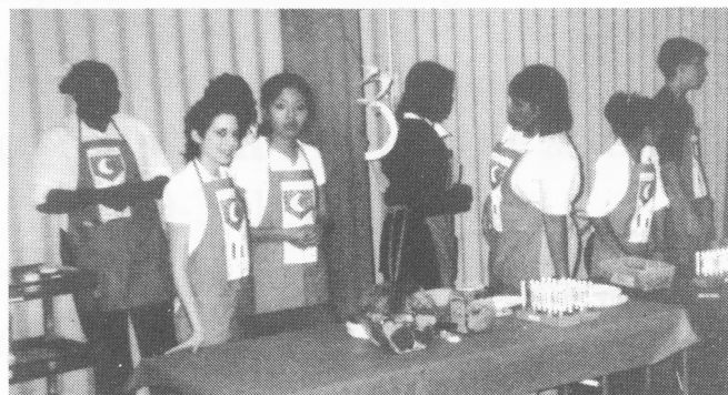
Lots of giveaways at Children's Museum.