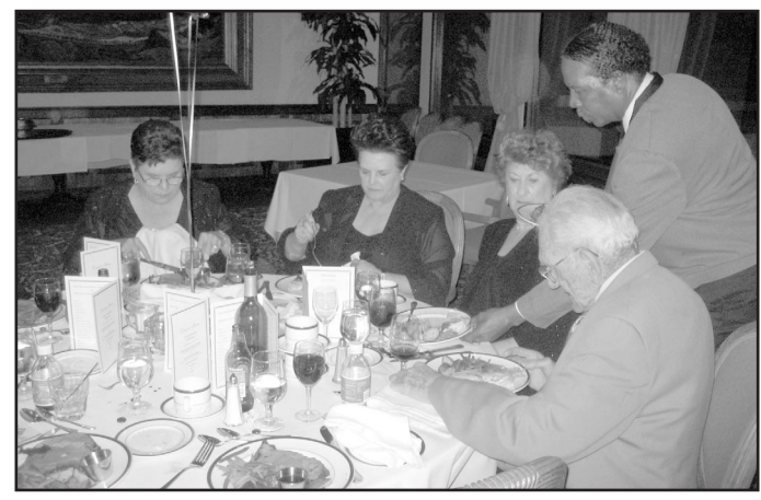
Members enjoying dinner with colleagues