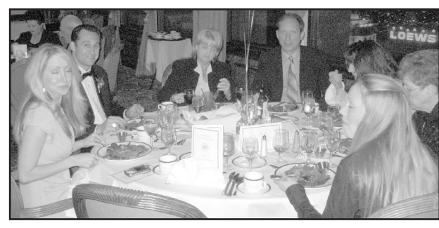
Members enjoying dinner