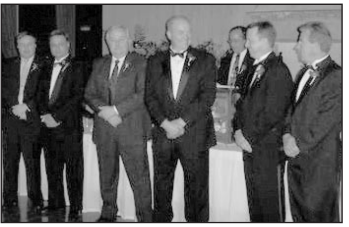
Installation of Officers