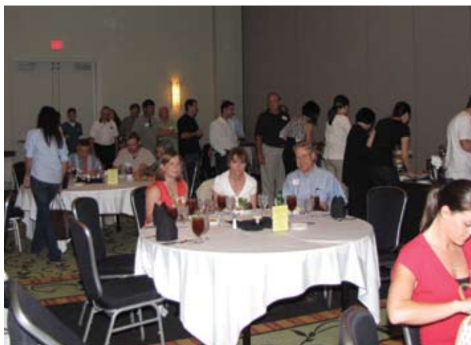
Members enjoying good food and networking!

NODA News is a publication of the New Orleans Dental Assn., 2121 N. Causeway Blvd., Suite 153, Metairie, LA 70001. Phone (504) 834-6449.