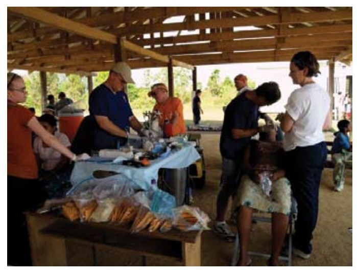
Clinic set-up in the village of Trio in Belize.