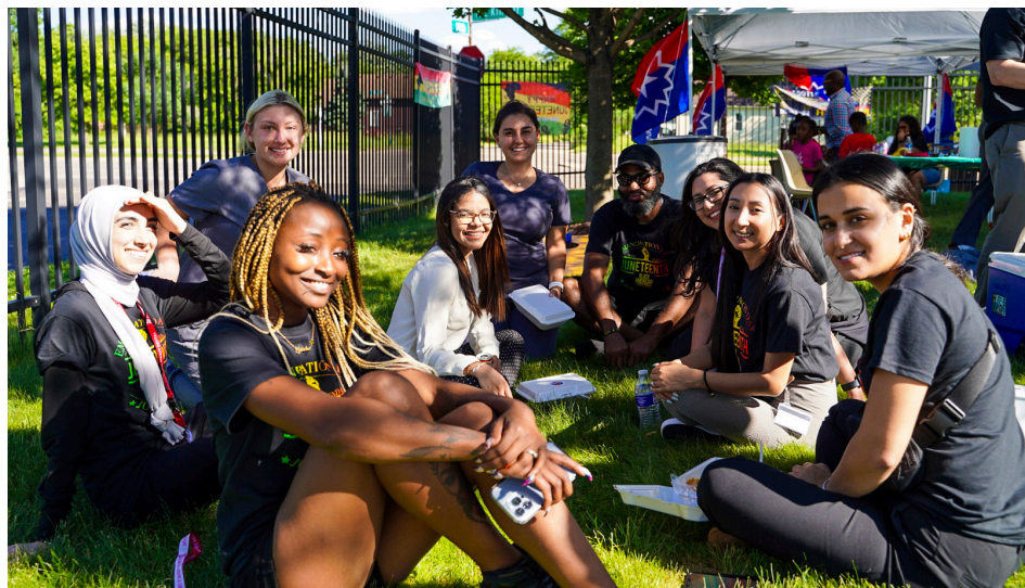
Fun on Juneteenth — Faculty, staff, students, and friends celebrated Juneteenth with fun, games, dancing and a walk.

After two years of remote programming, we were excited to welcome the 2022 SEP class in person. Since its inception, we have hosted nearly 140 pre-dental undergraduate students and are proud to report that as of May 2022, 60% of our SEP graduates