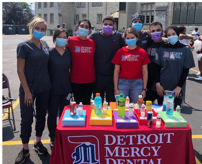
Volunteers — Second- and third-year dental students at the Hartford Memorial Baptist Church Back to School Fair.