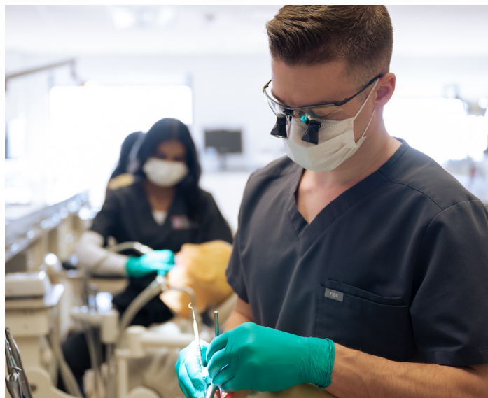
Sim lab — Dental students hone their skills during sim lab.