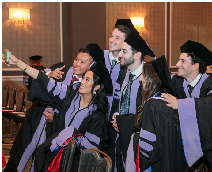
Happy moment — Dental students in the Class of 2022 pose prior to being hooded at their Hooding and Awards Ceremony.

Titans for Teeth Mobile Clinic. Over the past year, the Titans for Teeth Mobile Clinic (TFTMC) has resumed a regular schedule and provided services at 20 sites, including community centers and K-12 schools. Dental and dental hygiene students completed 3,576 procedures over 1,422 patient visits and served approximately 500