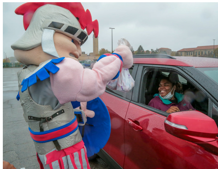
Safety Street — Tommy Titan handing out bags of candy and oral hygiene products during the annual Safety Street event.