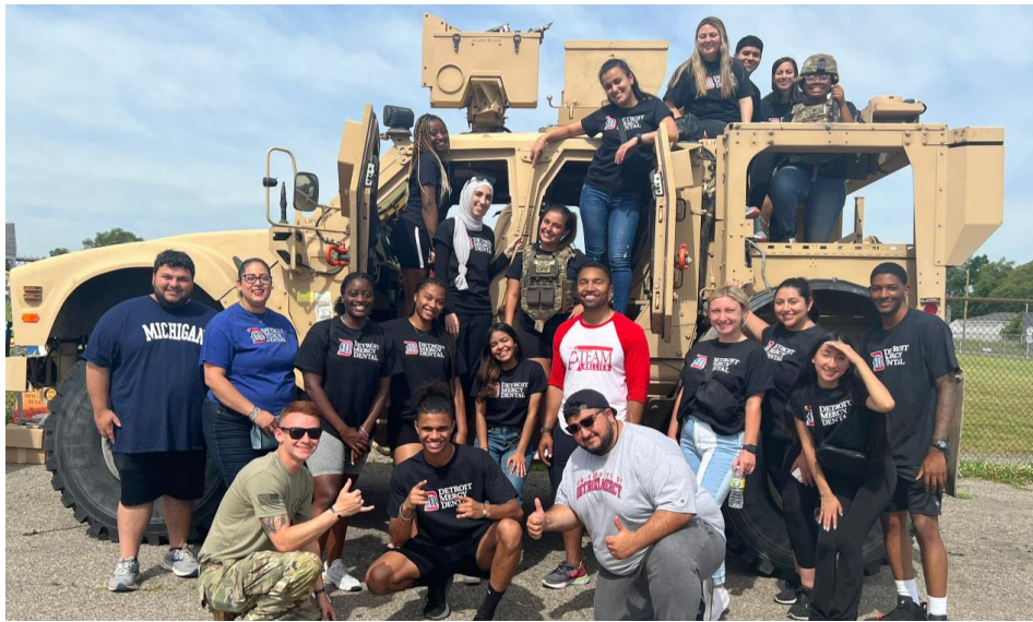
Summer Enrichment Program — Students volunteered at the East Family Reunion on Detroit's east side.

serves as a Commission on Dental Competency assessment consultant, was immediately struck by the school's need for simulation units. Unable to afford dedicated simulation units, students were performing pre-clinical exercises on decommissioned clinic equipment. Due to space limitations, not all students could participate at the same time.