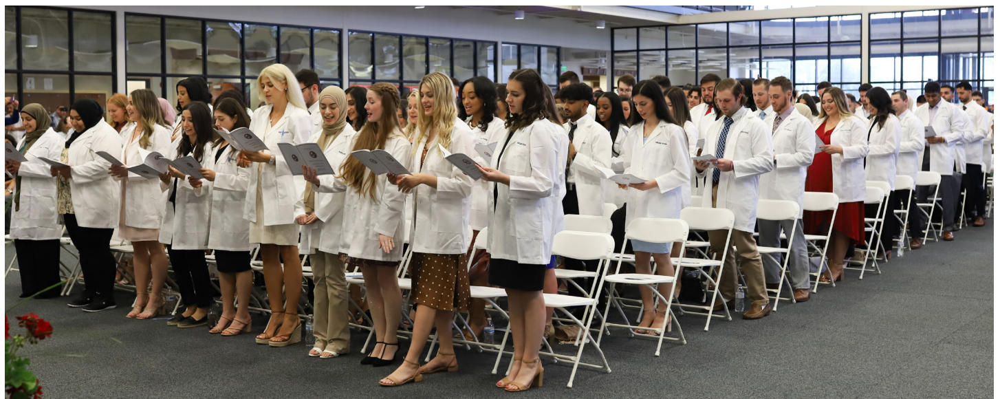
White Coat Ceremony — Together, the Dental Class of 2024 and the Dental Hygiene Class of 2023 recited their professional oath during the 2022 White Coat Ceremony, which formally marked the beginning of the patient care portion of their educational journey.

The demographic profile of the United States is ever-changing, as is the diversity of our profession and the patients we serve. By 2050, it is expected that half of the country's population will be composed of racial and ethnic minorities. This cultural shift underscores the importance of educating culturally sensitive practitioners — an important element of our Jesuit and Mercy identity. Having both a diverse workforce and student body benefits learners and patients alike. Cultural sensitivity improves patient compliance and care outcomes. To this end, Detroit Mercy is committed to recruiting and retaining