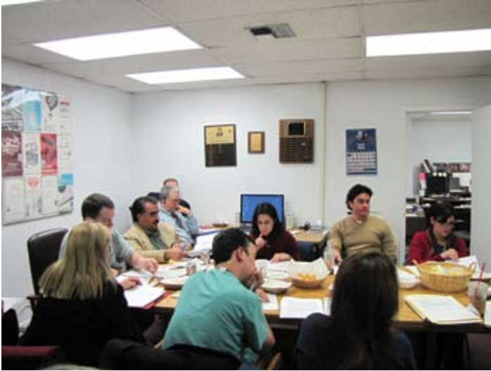
Delegates for NODA discuss upcoming issues for the LDA House of Delegates meeting.