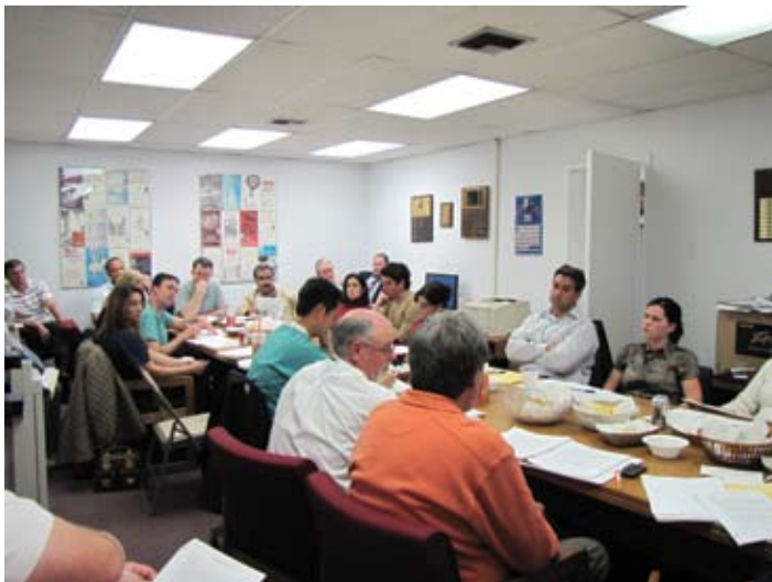
Delegates for NODA discuss upcoming issues for the LDA House of Delegates meeting.