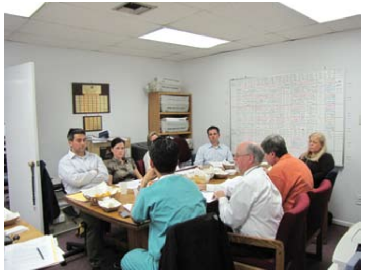
Delegates for NODA discuss upcoming issues for the LDA House of Delegates meeting.