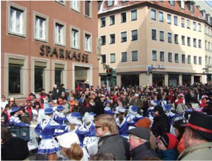
Fat Tuesday in Bamberg, Germany.