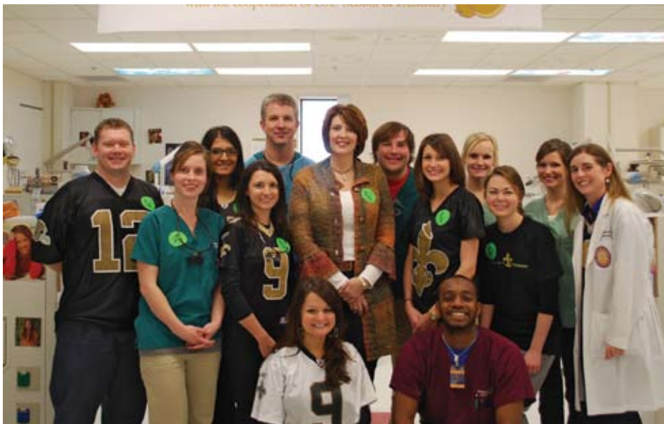
The team at the LSU School of Dentistry in New Orleans who screened 20 children ages 4 to 17, providing an examination, prophylaxis, fluoride and bitewings, for a total of $2,875 donated services.

If you would like to volunteer to donate your services to provide basic restorative and oral surgery care to any of these children, please contact me at ccavallino@bellsouth.net or 504/251-2558. We need your help!