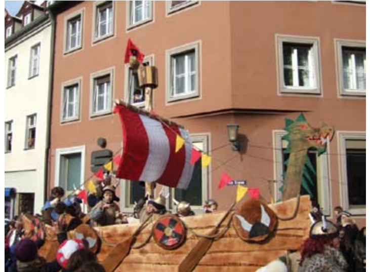
Fat Tuesday in Bamberg, Germany.