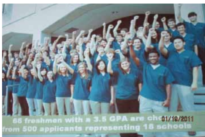
66 LSUSD freshmen with a 3.5 GPA are chosen from 500 applicants representing 18 schools.