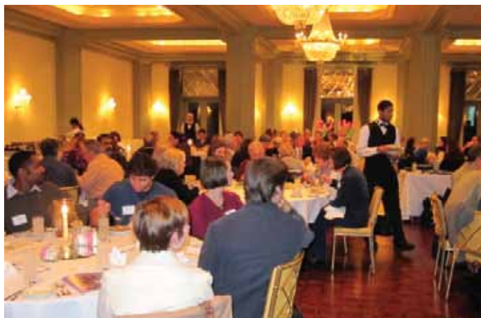
Many dentists and hygienists attending the lecture, "Waterlase MD All-Tissue Laser Applications."