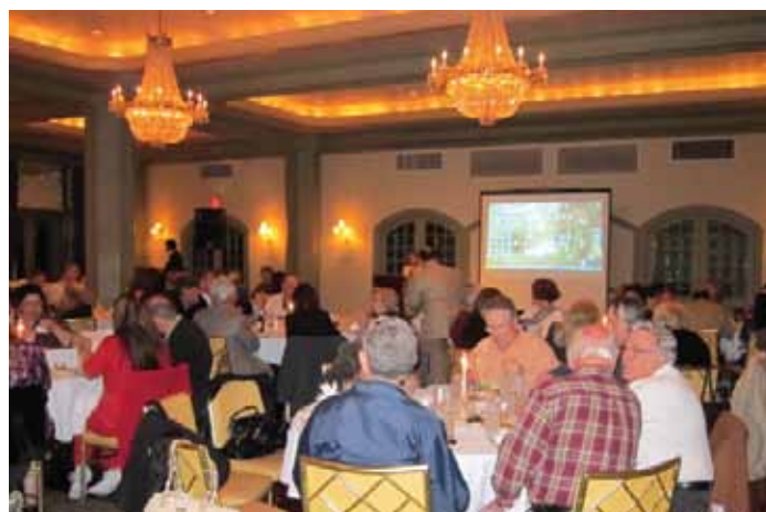
The attendees are discussing the issue of the lecture.