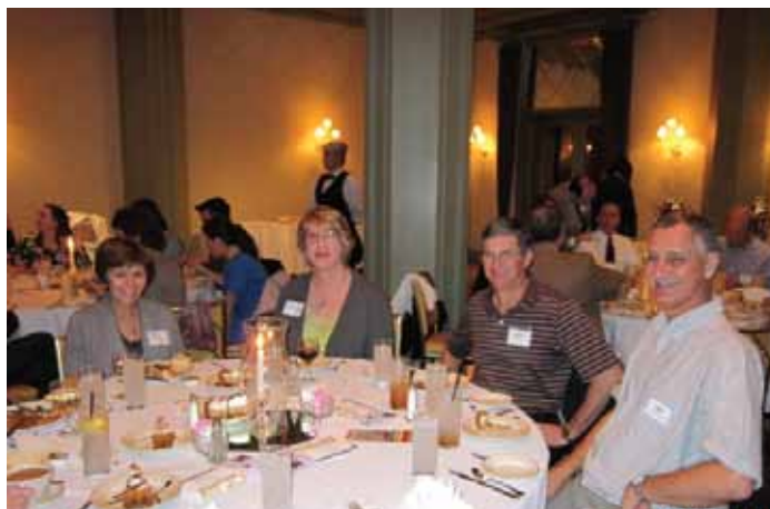
Everyone is excited for the beginning of the lecture.