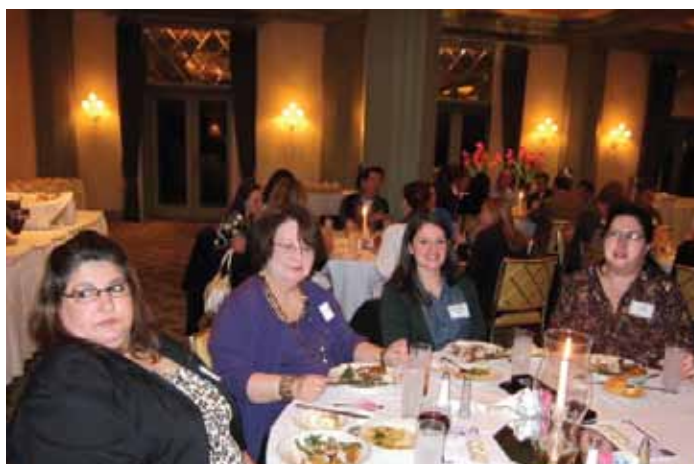
Attendees enjoying a tasty meal with their C.E.