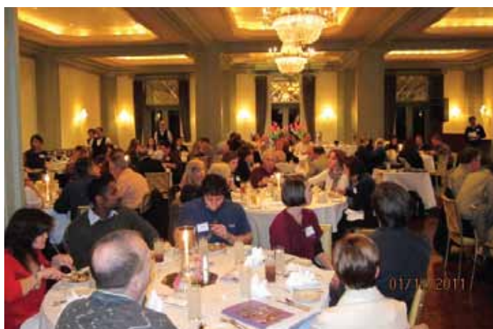
The attendees are preparing to listen to the C.E. program.