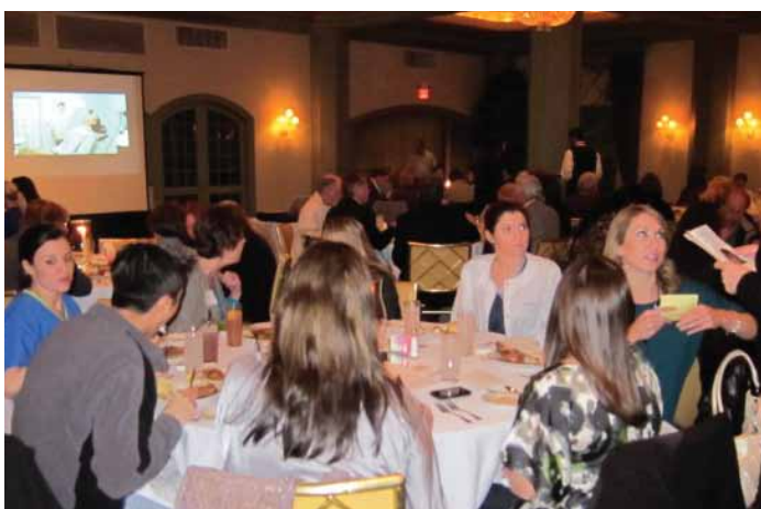
Last minute details before the beginning of the General Membership meeting.