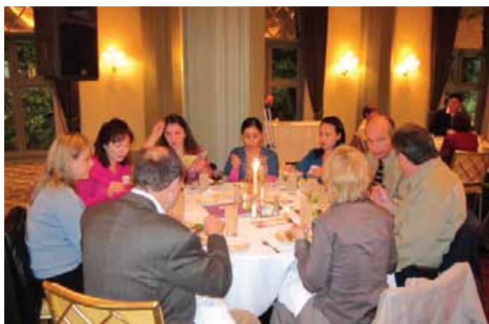
Dentists & hygienists are networking before the lecture.