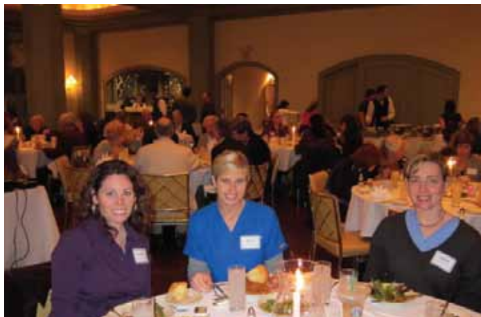
Great food, friendship and an informative lecture is a recipe for a terrific meeting.