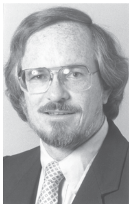
Answer on pg. 16