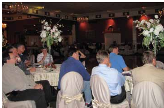
After a delicious meal, its time to relax and enjoy the lecture.