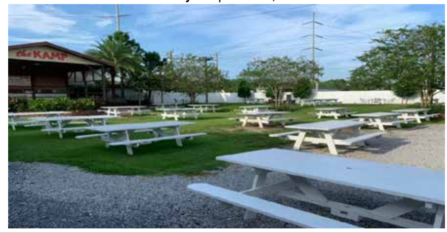
The Kamp 2317 Hickory Ave | Harahan, LA 70123