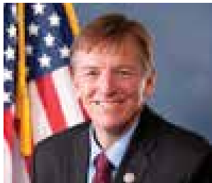
Congressman Paul Gosar, D.D.S. – AZ-04. Won with 70%

On Election Day 2014, three dentists were elected to the 114th Congress: