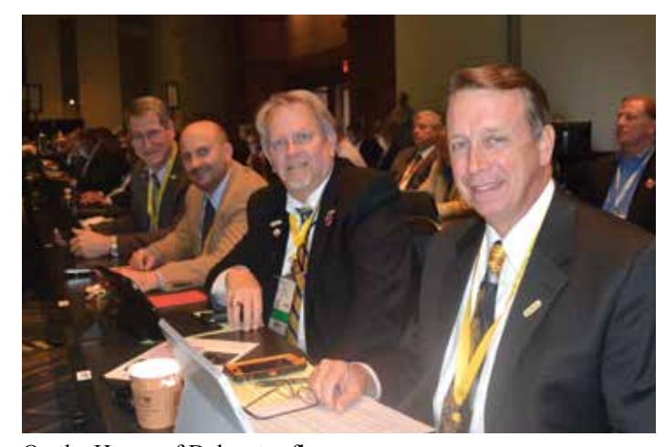
On the House of Delegates floor.