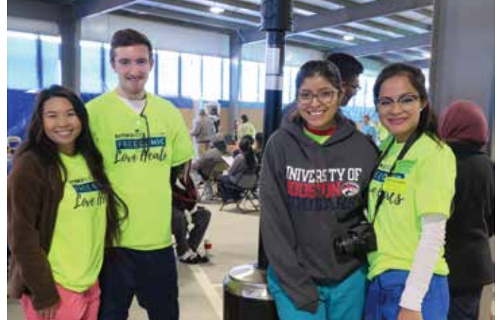
LSU School of Dentistry comes through again.