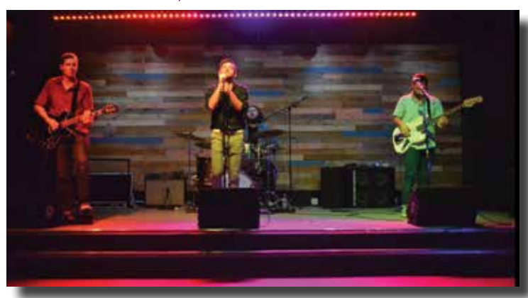
Le Bons Temps