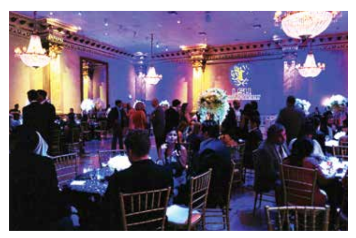
LSUSD Senior Graduation Reception at the Balcony Ballroom.