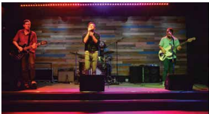
Le Bons Temps

ENTERTAINMENT BY LE BONS TEMPS Tickets: $40 per ticket (Includes buffet & two drink tickets per person)