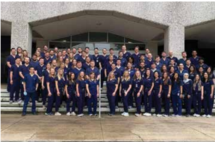
LSU D-1 Class Finally Takes its First Photo together as they begin Operative!