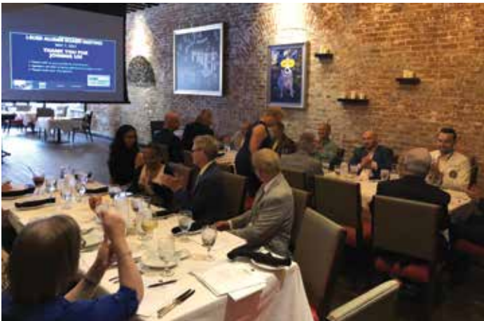
LSU Alumni Board '21 meets during the New Orleans Dental Conference/Louisiana Dental Association's Annual Session.