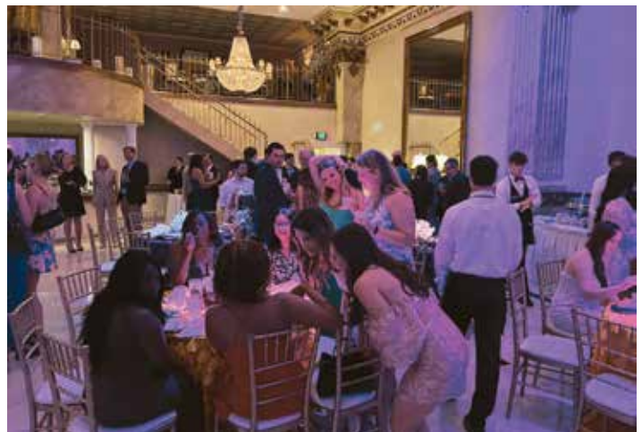
LSUSD 2024 Seniors Party The Balcony